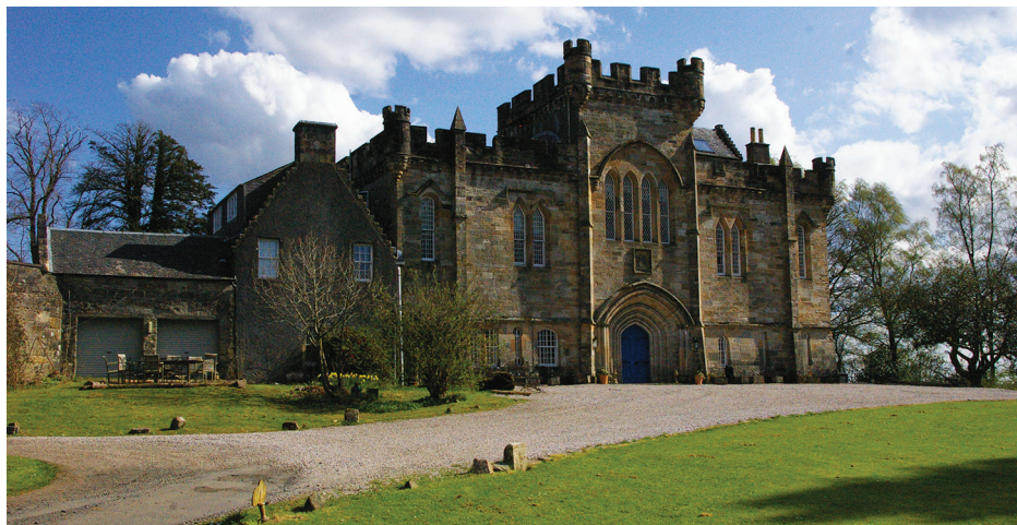
Kilmarnock and Loudoun ARC will be operating GB70M from the grounds of Craufurdland Castle.

Kilmarnock and Loudoun ARC will be hosting the GB70M on 4 June, operating from the grounds of Craufurdland Castle. The station will be operational on HF, VHF and the Freestar digital network. The special event station is open to visitors who can also take advantage of the amenities at the castle, which include a