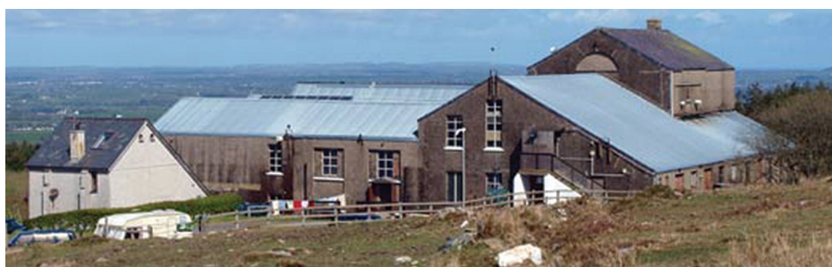
Dragon ARC will be operating GB70W from the historic Marconi transmitter site near Caernarfon.

Each callsign may only be activated from the Nation or Crown Dependency denoted by the suffix – for example GB70E is exclusively for England.